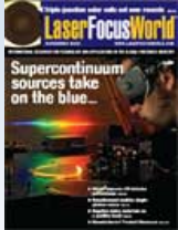
Volume 44 Issue 11 November, 2008